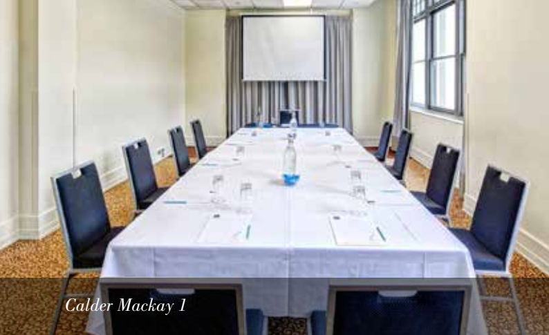
Calder Mackay 1