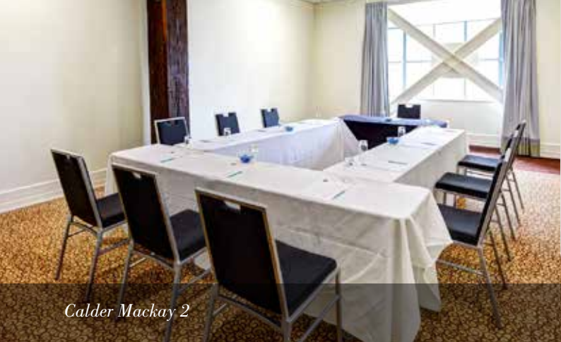
Calder Mackay 2