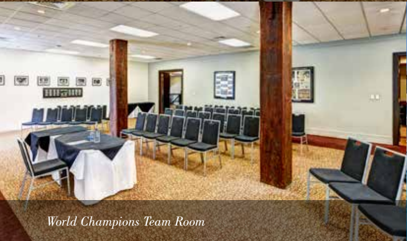
World Champions Team Room