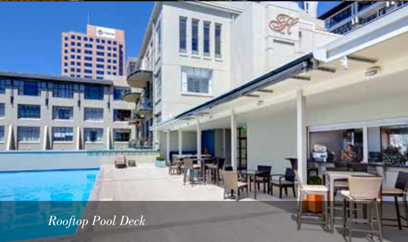
Rooftop Pool Deck